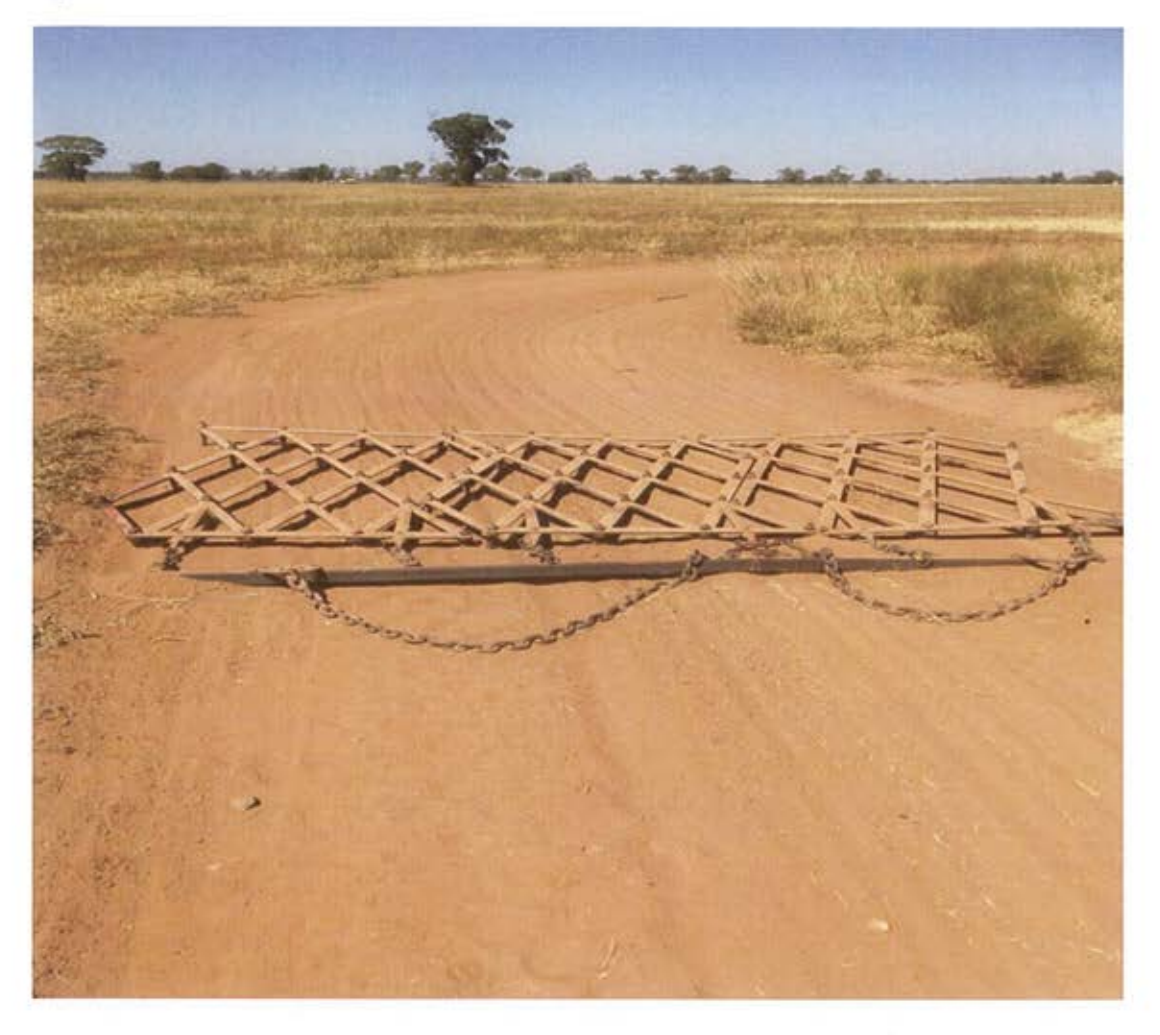
Figure 1 Drag Harrows

Please address all Correspondence to the General Manager, PO Box 115 Narromine NSW 2821 Telephone: (02) 6889 9999 Facsimile: (02) 6889 9998 Office Address: 124 Dandaloo Street Email: mail@narromine.nsw.gov.au Web site: www.narromine.nsw.gov.au