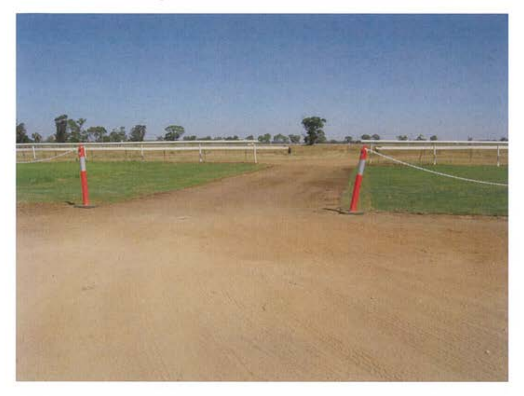
Figure 3 Pony club grounds, racetrack & showground arena

Figure 2 Entrance to dirt track and showground arena